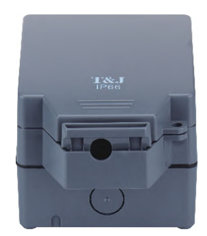
Lock holes provide for anti-theft.

Optimised clasp design allows easy pass through for cables.