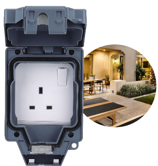
IP66 socket enclosures are compatible with 86mm height T&J wall plates.