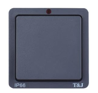
IP66 20A 1 Gang 2 Way Switch with LED indicator