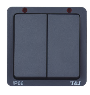
IP66 20A 2 Gang 2 Way Switch with LED indicator